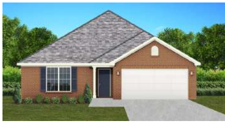
The Windsor $233,900