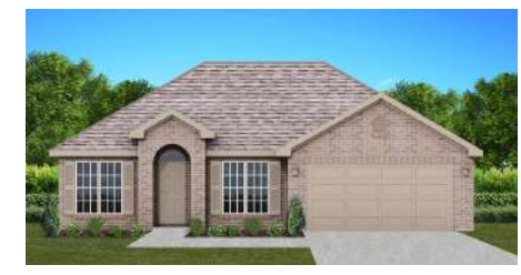
The Willow $241,300