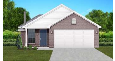
The Cambridge $230,400