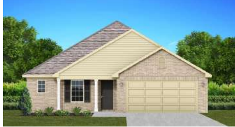
The Azalea $229,900