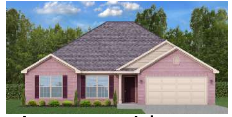
The Cottonwood $269,500