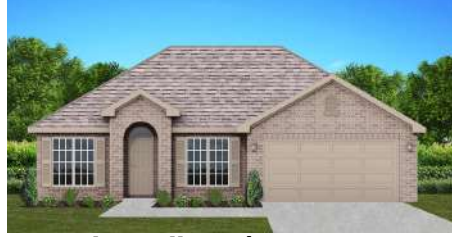
The Willow $268,500