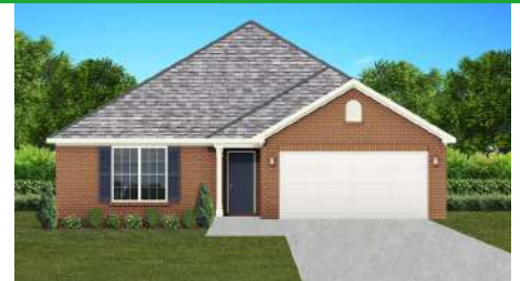
The Windsor $257,800