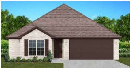
The Aspen $263,300