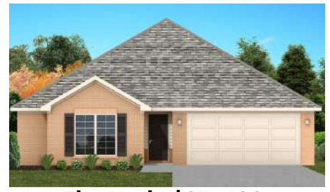
The Birch $271,400