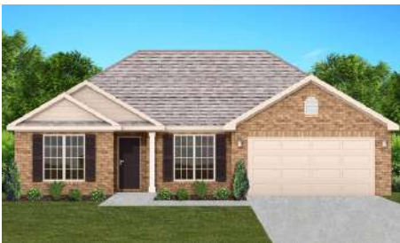
The Savannah $270,300