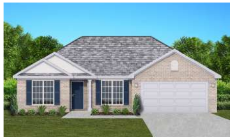
The Sawgrass $271,200