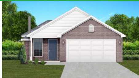
The Cambridge $253,600