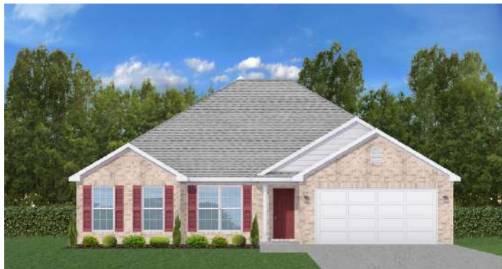
The Sweetbay $265,100