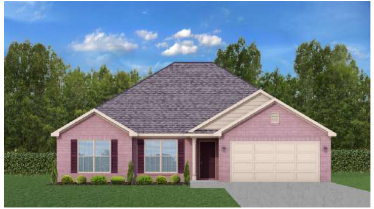
The Cottonwood $261,900