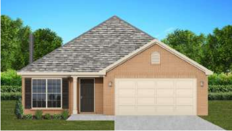
The Lily $260,200