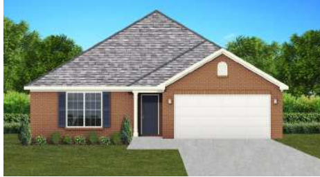
The Windsor $267,800