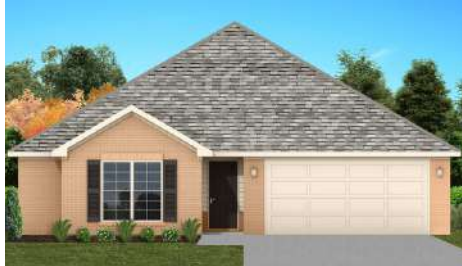
The Birch $281,400