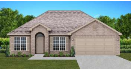
The Willow $278,500