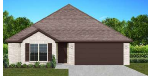
The Aspen $273,300