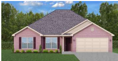
The Cottonwood $279,500