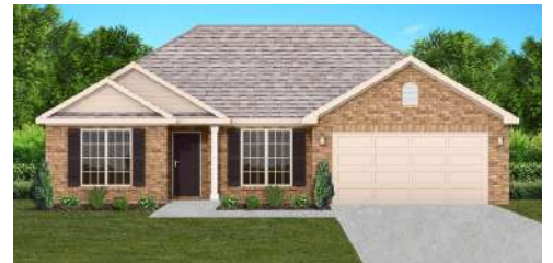
The Savannah $280,300