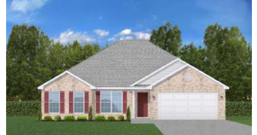
The Sweetbay $282,500