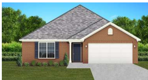
The Windsor $256,800