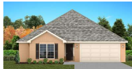
The Birch $270,400