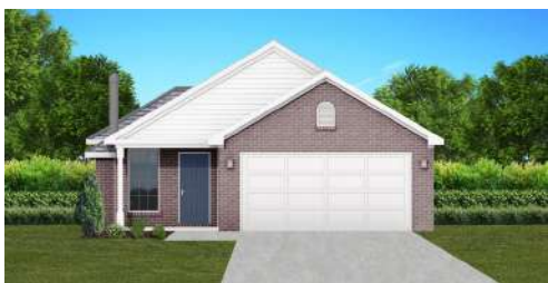
The Cambridge $252,600