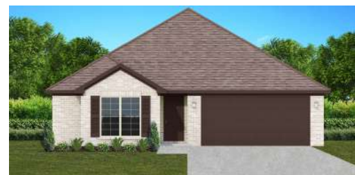
The Aspen $262,300