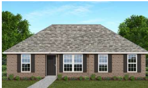
The Charlotte $237,300