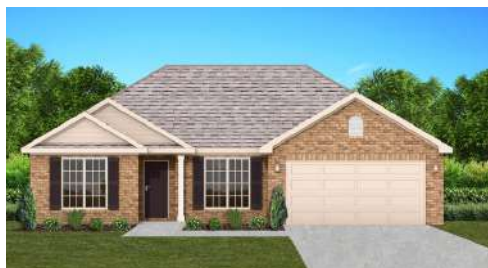
The Savannah $269,300