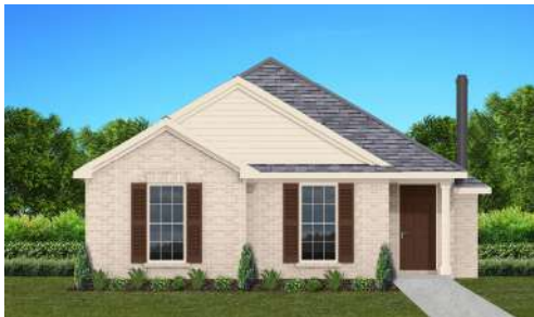
The Lilac $231,900