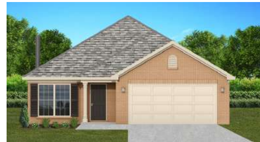
The Lily $249,200