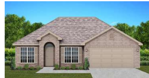
The Willow $253,300