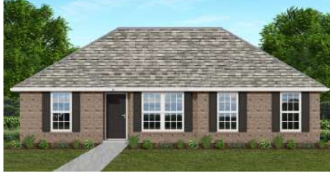
The Charlotte $228,500