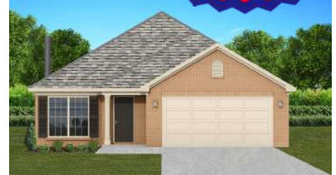
The Lily $231,900