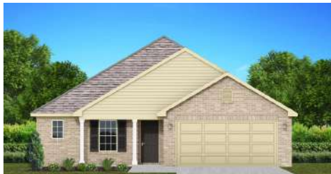
The Azalea $240,900