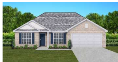
The Magnolia $265,300