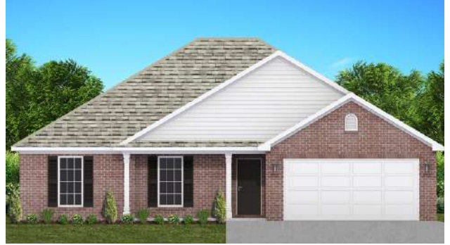
The Sawgrass $282,000