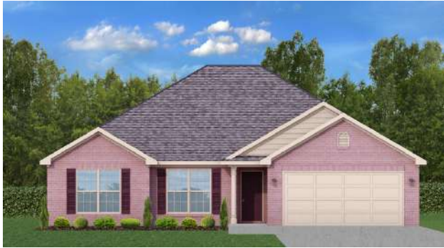
The Cottonwood $279,600