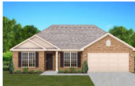
The Savannah $268,300