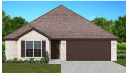
The Aspen $263,300