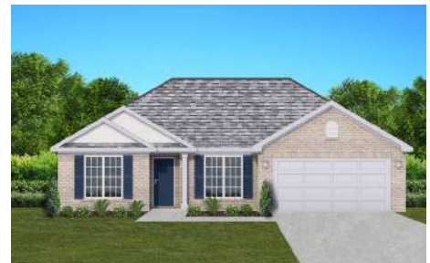
The Sawgrass $271,200