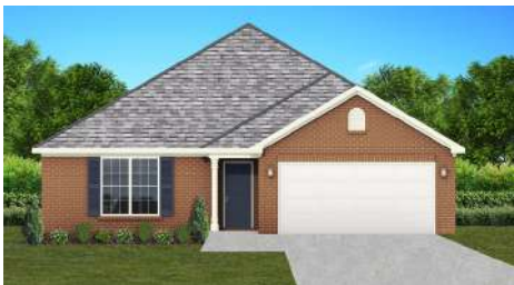
The Windsor $257,800