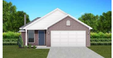
The Cambridge $253,600