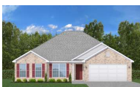
The Sweetbay $272,500