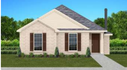
The Lilac $232,300