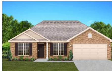
The Savannah $270,300