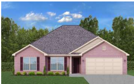
The Cottonwood $269,500