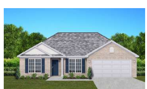
The Magnolia $276,200