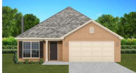
The Lily $250,200