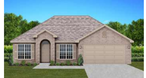
The Willow $268,500