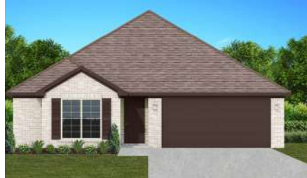
The Aspen $263,300