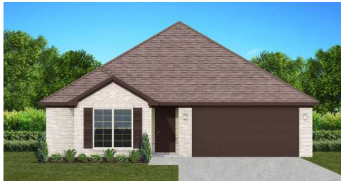
The Aspen $249,900