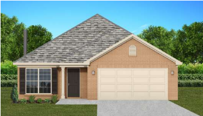
The Lily $231,900