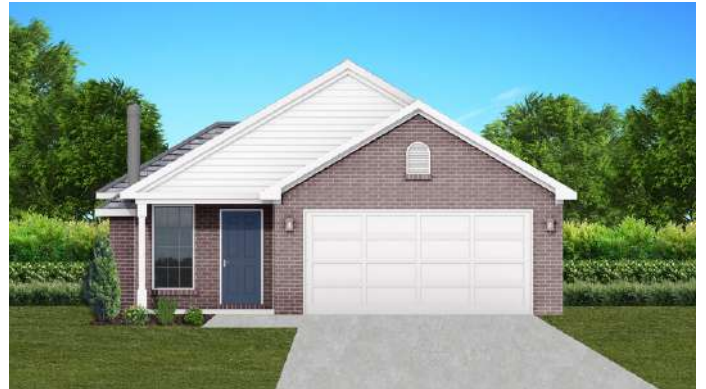
The Cambridge $236,900