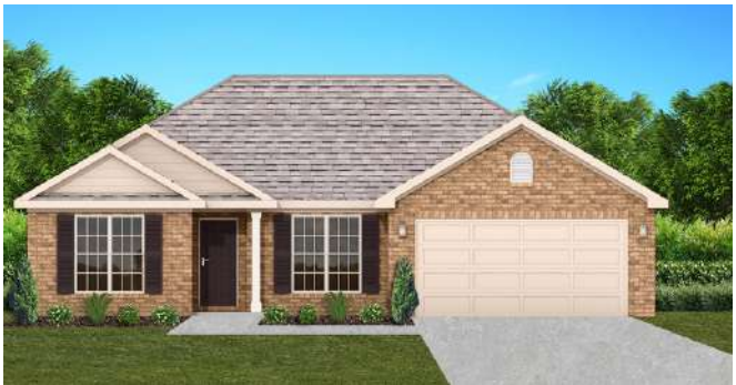
The Savannah $244,900