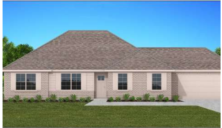
The Colorado $261,668