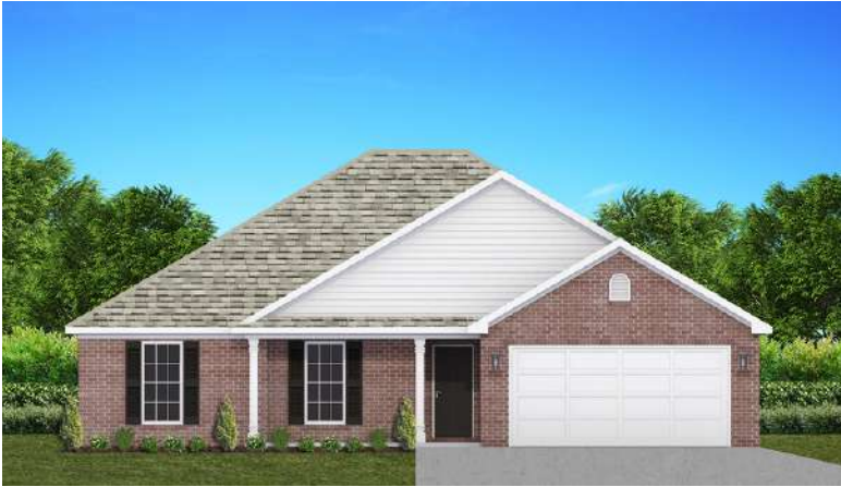
The Sawgrass $261,286