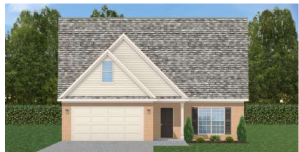
The Brittany $324,900