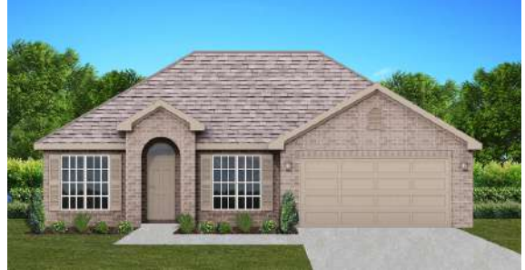
The Willow $287,900