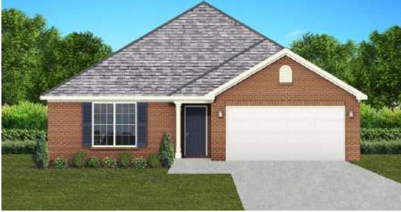
The Windsor $277,900