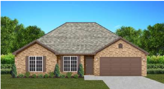
The Palmetto $291,900