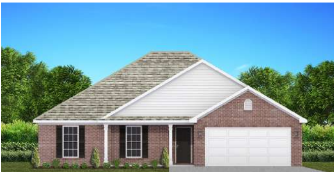
185 Hornsby Street $277,200